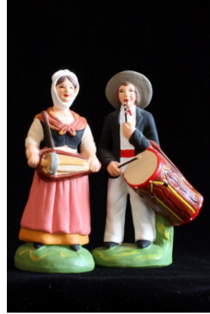
Santons from Provence